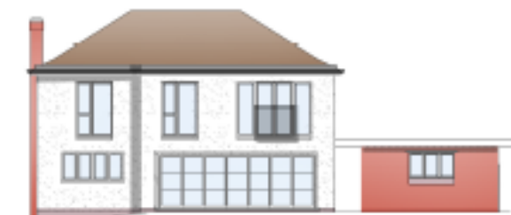
REAR ELEVATION SCALE 1:50