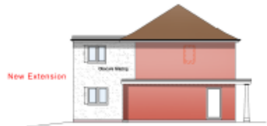
SIDE ELEVATION SCALE 1:50